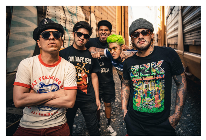
"Mexico's finest psychobilly marimberos" —Remezcla