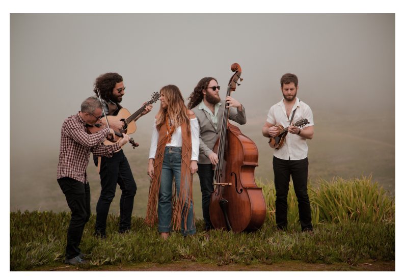
"Nefesh Mountain preach peace, understanding, and acceptance with musical muscle." —Rolling Stone

Through klezmer melodies and Hebrew refrains, the boundary-pushing bluegrass Americana band Nefesh Mountain shares the beauty of Jewish culture with the world.