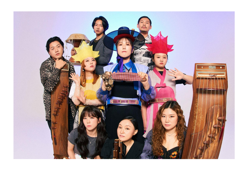
"WOW ... A most astonishing show musically and immensely entertaining." —NPR Music

Impressing audiences with their "candy-colored costumes and bouncy, upbeat, often swinging songs" ( New York Times ), South Korea–based ensemble Ak Dan Gwang Chil (ADG7) connects shamanic ritual music and beloved folk songs of the Hwanghae region to the contemporary sounds and influences of pop. In 2020, ADG7 was a featured artist in the Skirball's virtual concert series, Skirball Stages, which can be viewed on the <u>Skirball's YouTube channel</u>.