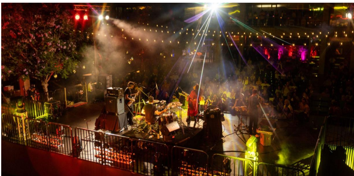
Bab L' Bluz performs during Sunset Concerts at the Skirball in 2024.

Concerts begin at 7:00 pm, Doors at 6:00 pm